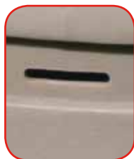
Air Vent Slots