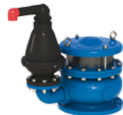
VB-060 + D-025

Please see the table below for all the additional air valve options available.