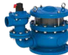
VB-060 + D-070

Please see the table below for all the additional air valve options available.